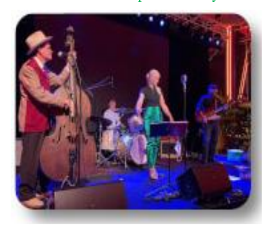
Friday 29<sup>th</sup> September will be 'Taylor Made Blues'

The Earlybirds (great local band) start at 6pm, then the main band kicks off at 7.30pm. Go early for a meal!